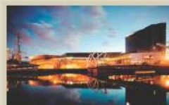
Melbourne Convention & Exhibition Centre

Annual Report For the year ended 31 March 2022